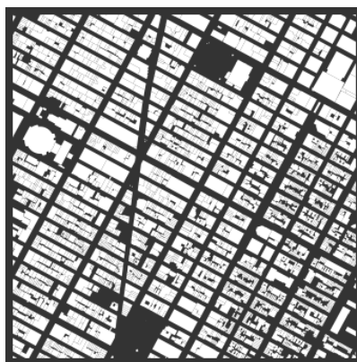
Figure 7: Output from codebox 19