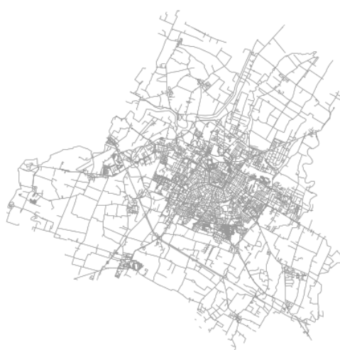
Figure 4: Output from codebox 15

graph_from_polygon function. Or we can pass in latitude-longitude coordinates and a distance into the graph_from_point function as demonstrated here, where we visualize the network within a bounding box around the University of California, Berkeley's Wurster Hall: