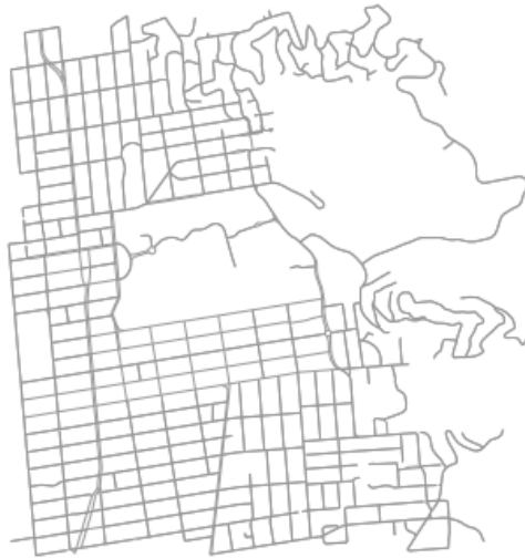
Figure 5: Output from codebox 16

Note that the preceding code snippet modeled subway rail infrastructure which thus includes crossovers, sidings, spurs, yards, and the like. For a station-based train network model, the analyst would be best-served downloading and modeling a station adjacency matrix.