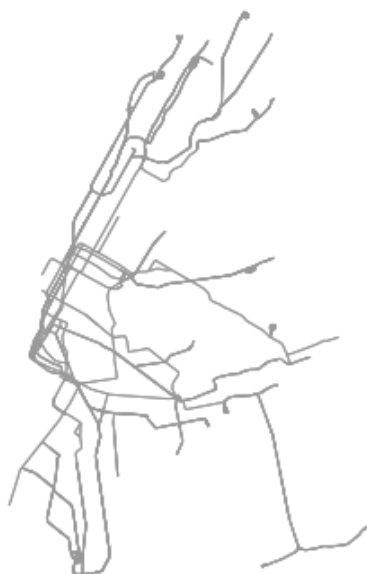
Figure 6: Output from codebox 18