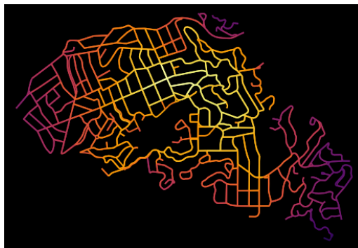
Figure 2: Output from codebox 9

and intersections become edges. Then we calculate the closeness centrality of each node (i.e., street in the line graph):